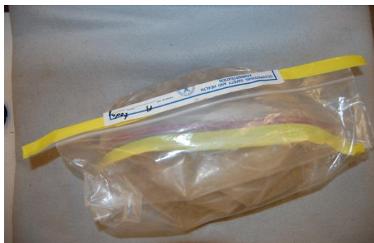
Figure 2.3. A properly packaged, sealed, and labeled excavation sample.

Obtain a representative sample for each soil layer in the excavation by using any safe means. Place the sample inside an airtight plastic bag and seal across the length of the opening with moisture resistant tape. Place this bag inside a second airtight plastic bag and again seal across the length of the opening with moisture resistant tape. Place Form OSHA-21 across the seal lengthwise. Figure 2.3 shows a properly packaged, sealed, and labeled excavation sample.