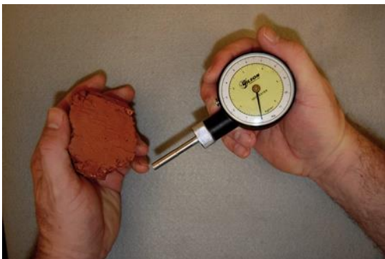
Figure 3.4.1.2. Flat face of sample ready for testing.

Zero the dial penetrometer and take a minimum of three readings on the faces of the freshly exposed interior of the clump. This is accomplished by pressing the flat face of the penetrometer cylinder against a freshly cut flat face of the soil clump, holding it perpendicular to the exposed face, and pressing slowly and steadily until the cylinder has penetrated as far as the indicator ring engraved on the cylinder. Stop pressing and read the value directly from the penetrometer dial. Record the value in tsf on the analytical worksheet. Zero the penetrometer between each reading. Record up to six values. Calculate the average of the values; round to one decimal place, and record this value.