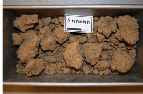
Figure 3.4.1.1. Ideal photo of an excavation sample.

Take a color photograph of the sample using a digital camera to document some of its visual characteristics. Record that the photograph was taken. Ensure the photograph is representative of the sample and that its features such as loose sand, gravel, soil clumps, and fine soil are clearly visible. Figure 3.4.1.1 shows an ideal photograph, with the excavated material filling the photo frame and the lab sample identifier clearly visible.