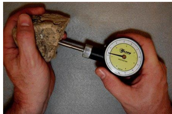
Figure 3.4.1.3. Testing with a penetrometer.